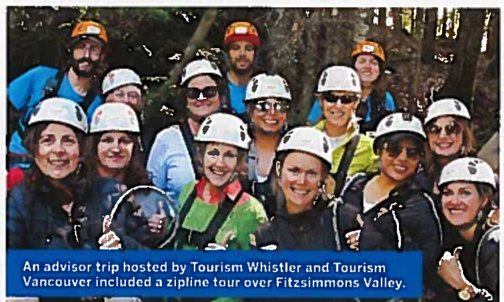
An advisor trip hosted by Tourism Whistler and Tourism Vancouver included a zipline tour over Fitzsimmons Valley.