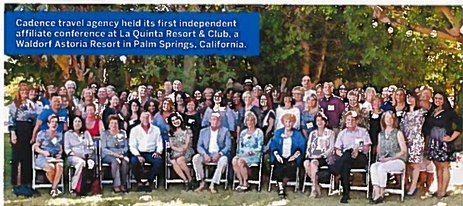
Cadence travel agency held its first independent affiliate conference at La Quinta Resort & Club, a Waldorf Astoria Resort in Palm Springs, California.