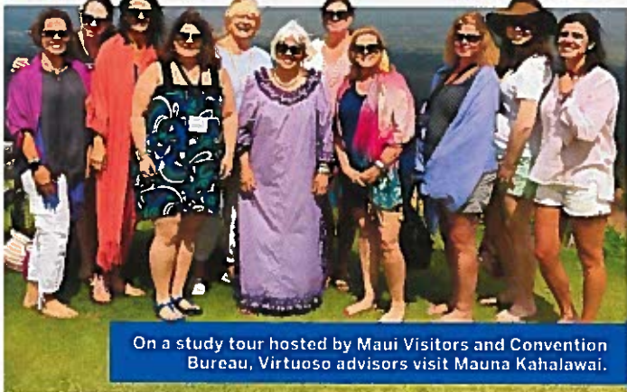
On a study tour hosted by Maui Visitors and Convention Bureau, Virtuoso advisors visit Mauna Kahalawai.